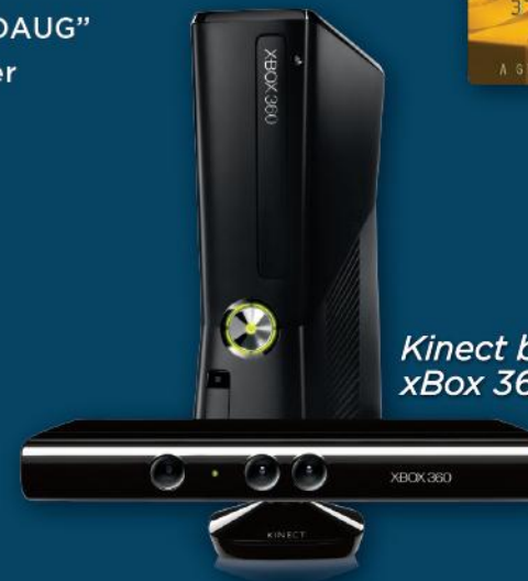
Kinect for xBox 360

Visit the O Users Gro Level 2 in to particip Sweep dra prize of yo 360 Kinec AmEx gift ence atten not - is eli four chanc